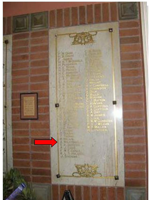
Blue Mtns District Hospital Honour Roll